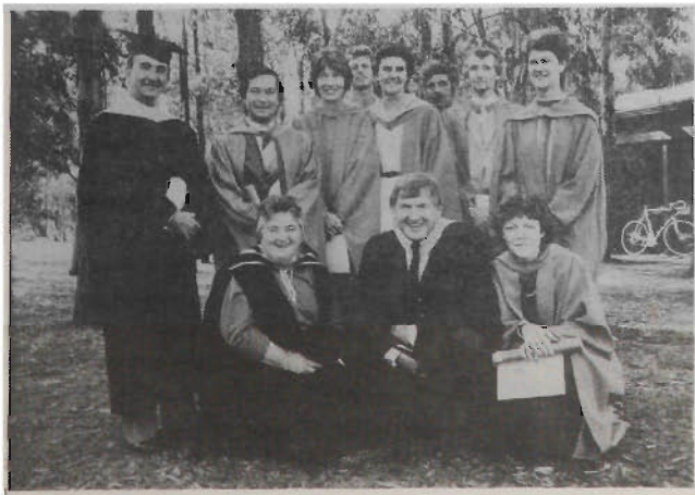
The Nowra Group and their lecturers

of lecturing staff, suitable venue, library resources and lecture times.