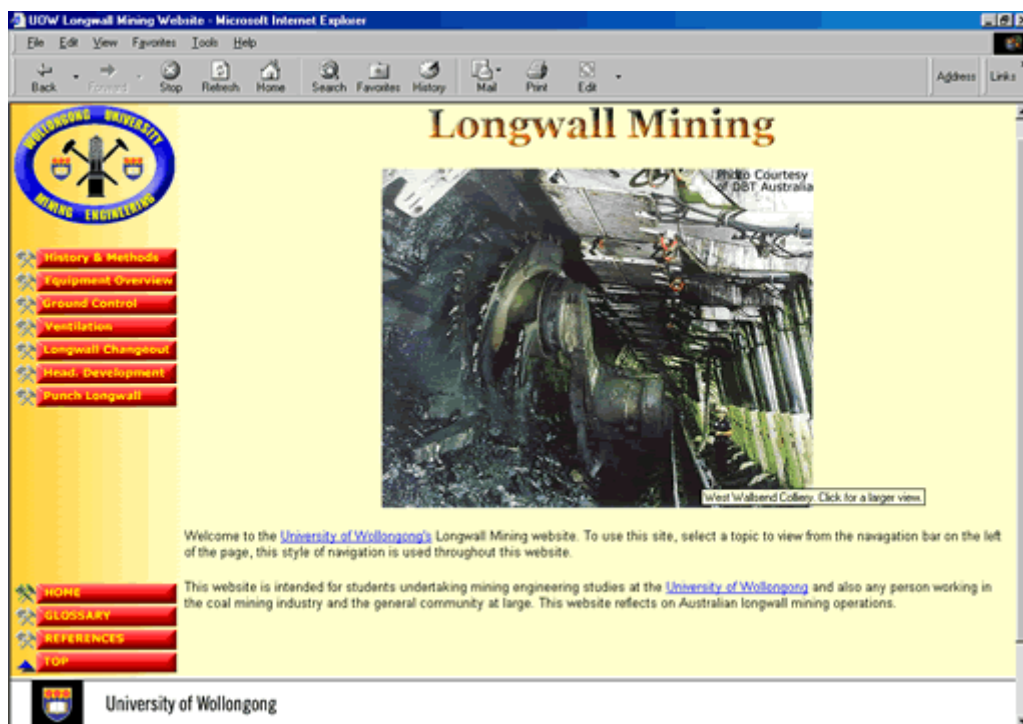
Fig. 1 Front Page of the Longwall Mining Web Site

To make it easier for students to use the site a standard/template was developed and this structure was incorporated onto every web page. A general view of the front page of the website can be viewed in Fig. 1.