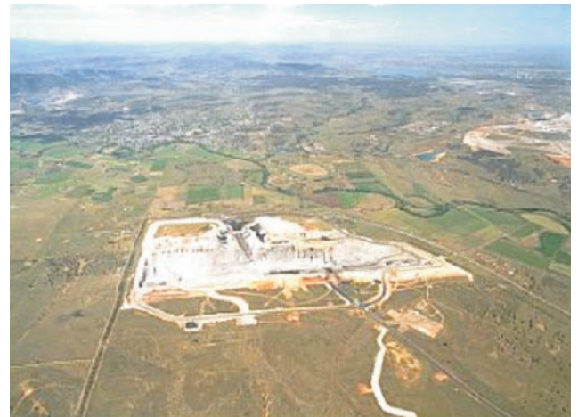
FIG 3 - Bengalla Coal Mine with Muswellbrook township in the background.

Bengalla Mine is managed by Coal and Allied on behalf of Rio Tinto Coal and its partners. It is a low-cost operation in the Hunter Valley producing six million tonnes of coal in 2003 and blasting 19 million bank cubic metres of material. Bengalla is 1.5 km from the township of Muswellbrook and is surrounded by a number of residences as shown in Figure 3. The management of environmental effects including blast induced fumes on its surroundings is of paramount importance to the mine.