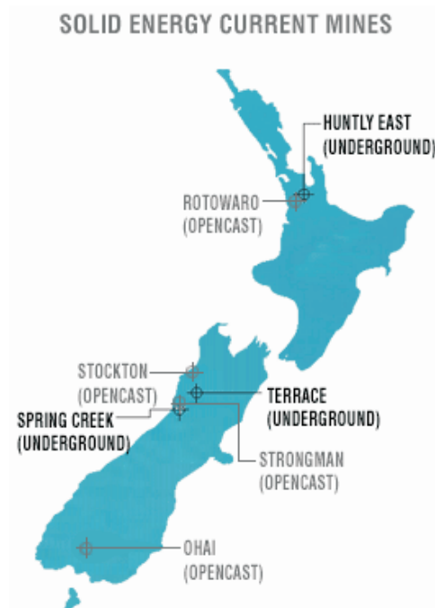
FIG 1 - Location map of SENZ mining operations.

of new generation. This would create an anticipated additional demand for up to 3 Mtpa of coal.