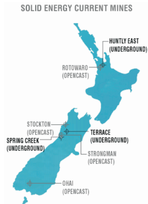
FIG 1 - Location map of SENZ mining operations.

of new generation. This would create an anticipated additional demand for up to 3 Mtpa of coal.