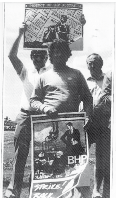
Right: Workers with Redback posters on their way to storm Federal Parliament.