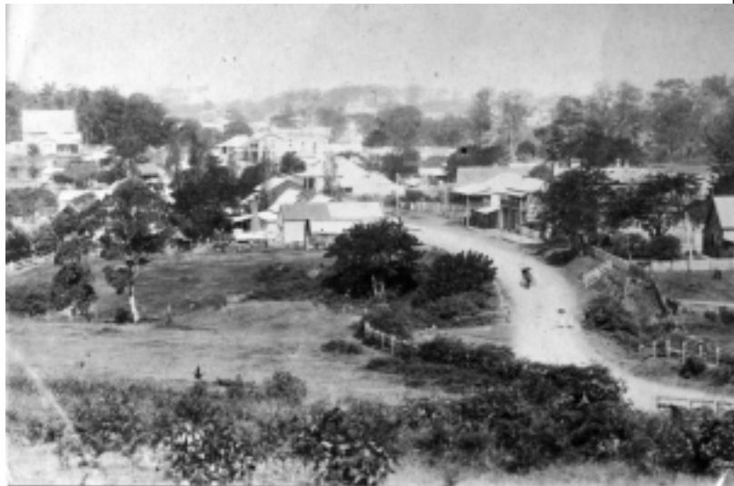
Bulli Village, circa 1887. View from the north looking south along the main Bulli road. Bulli Public School (1869) can be seen in the right foreground, while the Wesleyan church is visible on the hill in the left background, and the Denmark Hotel can be seen by the road in the centre of the picture. The January 1887 confrontations between the local community and the blacklegs took place on the road in the middle of the image, adjacent to the two-storey buildings in the middle right of view, and near the present-day Princes Highway and Hobart Street intersection.