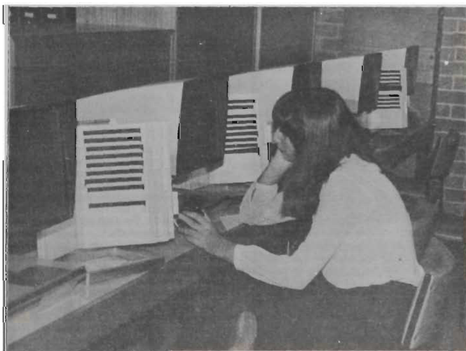
A student in the Library.

For more information, contact Wollongong's Public Relations Unit.