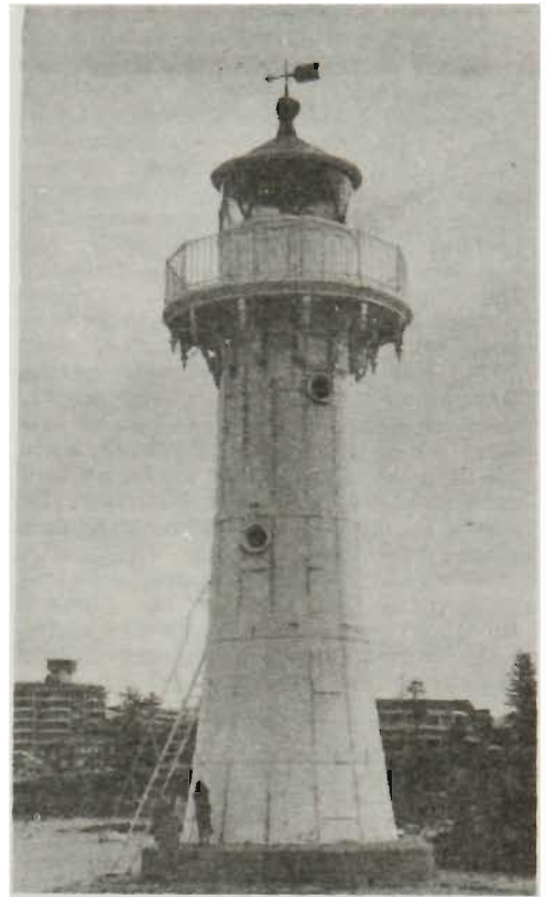
Above: The historic Lighthouse at Belmore Basin.