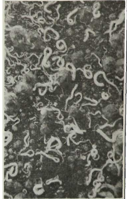
Above: Closeup of a fouling community showing calcareous tubeworms and barnacles.