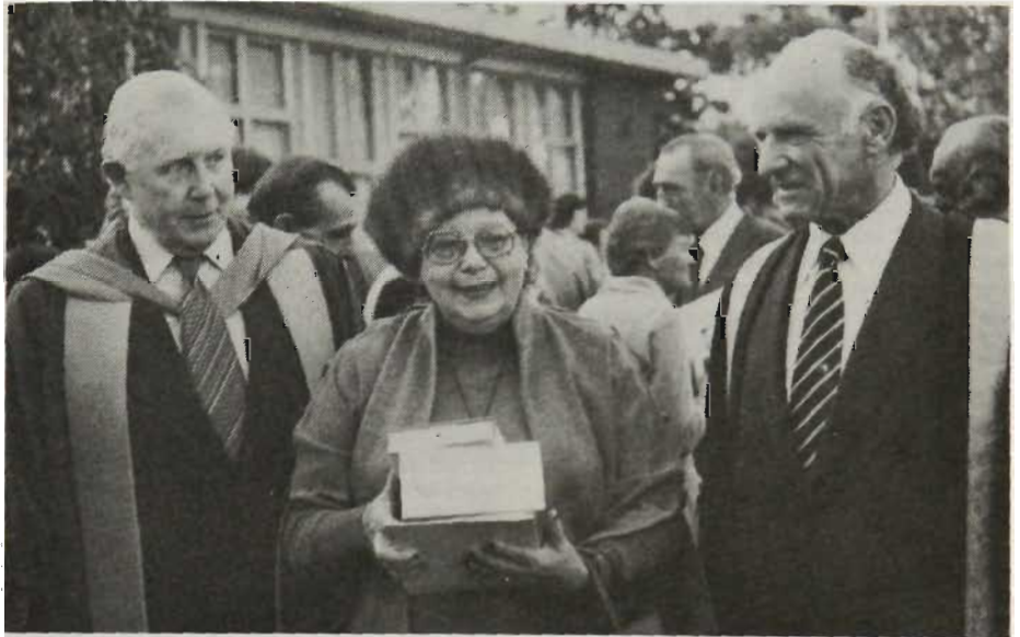
Below: Tea and conversation on the lawn followed each graduation ceremony.