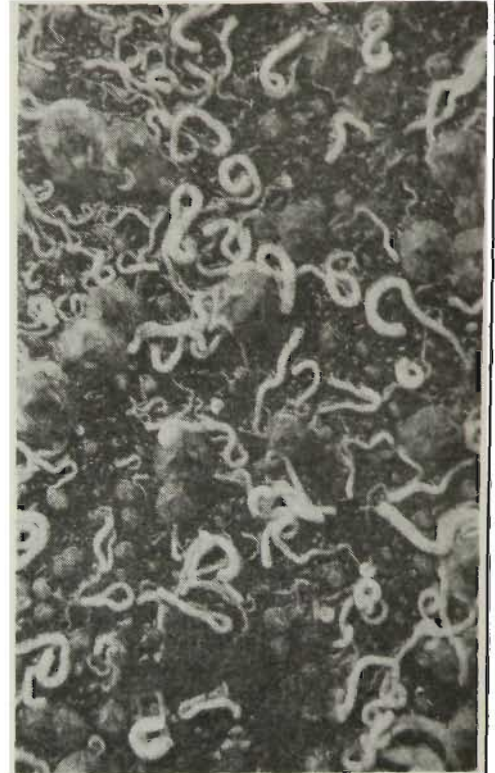
Above: Closeup of a fouling community showing calcareous tubeworms and barnacles.