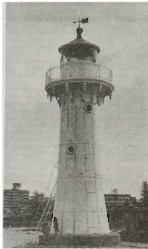
Above: The historic Lighthouse at Belmore Basin.