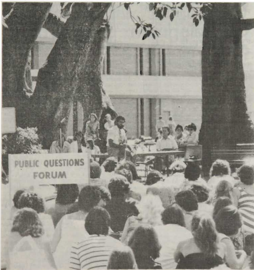
A SECTION of the big crowd at the first Public Questions Forum under the fig trees on March 15. The speakers are in the background.

To obtain the discount, people will have to show a current I.D. card or a fee receipt.