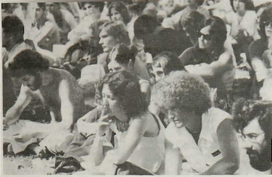
AN INTENT section of the big crowd which took part in the first Public Questions Forum under the fig trees on March 15.