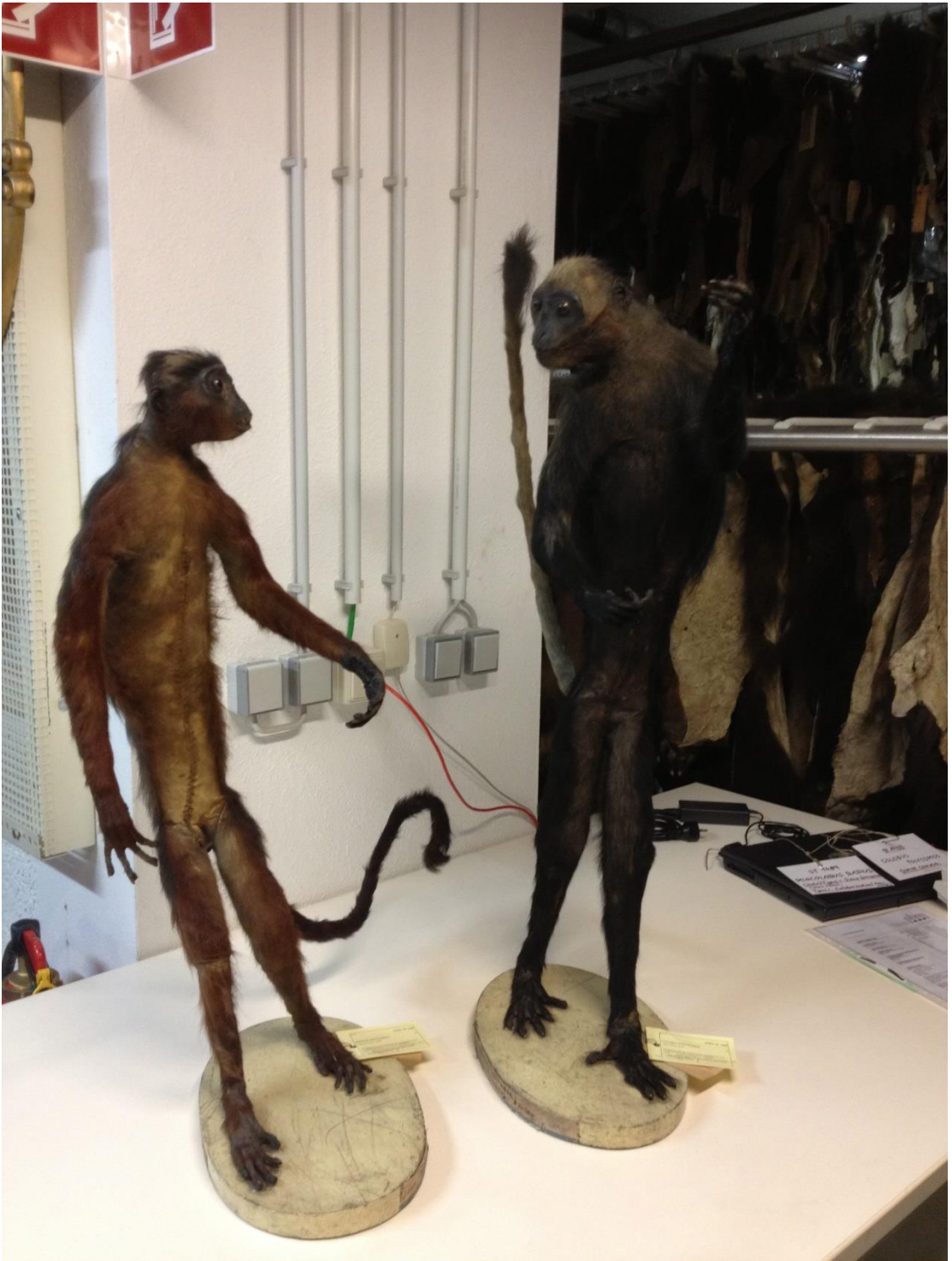
Fig.2 King Colobus monkey (Colobus polykomos) and Western Red Colobus monkey (Piliocolobus badius); author's photograph, courtesy of the Vienna Natural History Museum.