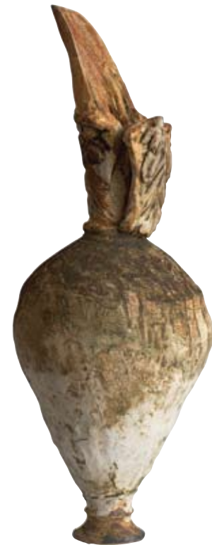
image: Elizabeth Charles, Jug III , 2006, slips, dry glaze on stoneware, 70 x 27 x 27cm.