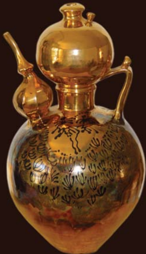
Image: Alan Peascod, Gold form , 1979, thrown form with press moulded components. Gold lustre with resists. Stoneware. 40cm (h).

Museo Hispano/Arabe Alhambra Palace, Granada, Spain Vice Presidential Collection Washington DC Auckland Museum and Art Gallery Toi o Tamaki Auckland, Dresden Museum, Dresden, Germany International Ceramics Museum, Faenza Italy Pallazzo dei Consoli Museum, Gubbio, Italy