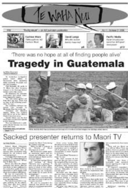
Figure 3: Te Waha Nui , issue No 11, October 21, 2005.

This means some inappropriate outlets have to be used and there has also been a reduction in the number of published stories overall. Another adverse factor is a growing need for the students to devote much of their out-of-class time to paid employment, allowing less time and a reduced motivation to write news stories for publication. (p. 3)