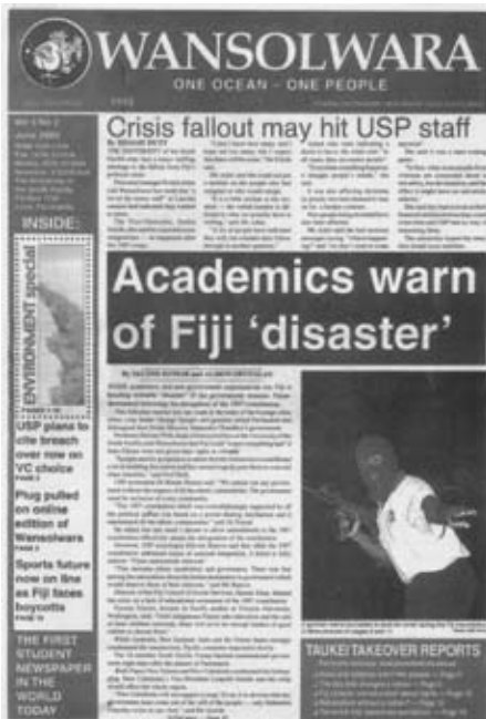
Figure 2: The Speight coup edition of Wansolwara , issue 5(2), June 2000.

(Headlines from the Wansolwara edition of September 2001 covering that year's general election).