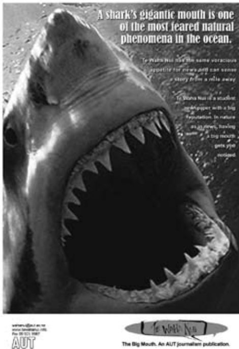
Figure 5: An advertisement promoting Te Waha Nui by creative advertising students at AUT, using a “big mouth” metaphor with a shark, snake and crocodile.

by the editorial team. The format for the paper has settled from a 32-page inaugural edition to a regular 24-page tabloid with a minimum of eight pages in four-colour. A print run of 2000 copies is produced and a quarter of the papers are sent to a national mailing list comprising media industry offices, journalism schools, leading libraries and a cross-section of community, NGO and other readers. The paper has an eclectic mix of news, features, columns – including one or two regular staff contributors such as professor Paul Moon, of AUT’s Te Ara Poutama, who is an authority and author on the 1840 Treaty of Waitangi, New Zealand’s founding document – and special sections including Pasifika media, taha Maori assignments, ethics and sport.