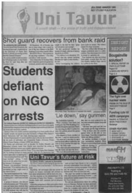
Figure 1: A Uni Tavour front page reporting a bank raid at UPNG, 16 May 1997.

Students defiant on NGO arrests UN hails PNG human rights charter Bougainville solution? Promises and lies Don't blame us after the poll, warn key women (Headlines from Uni Tavour , 16 May 1997 – last edition before the 1997 general election). (Figure 1)