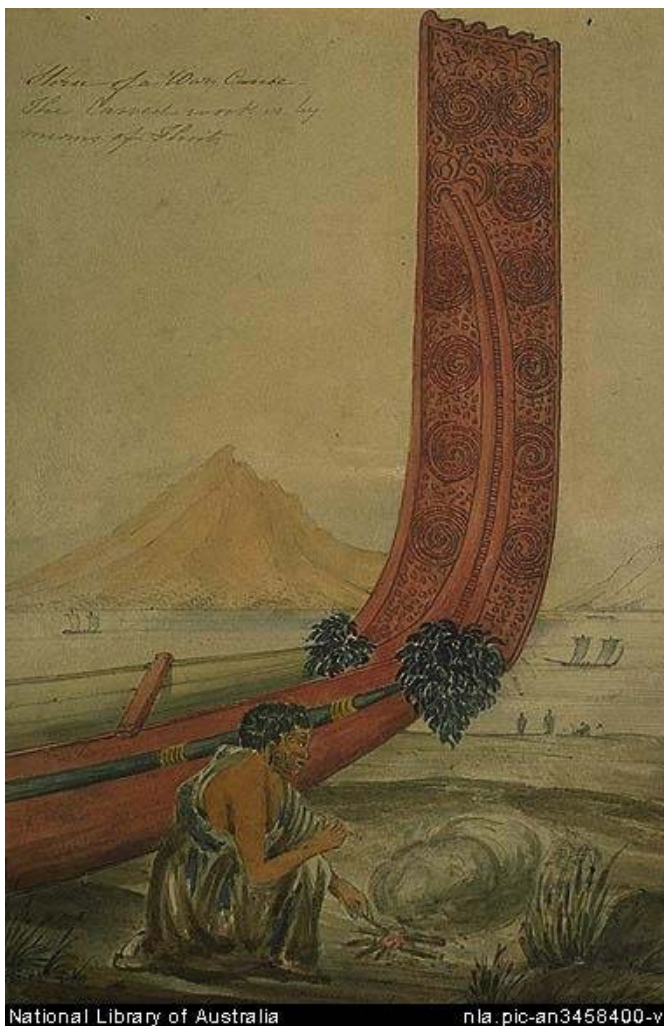
ROBERT MARSH WESTMACOTT Stern of a War Canoe. The carved work is by means of flints (c.1851) Watercolour and pencil on paper, 350 x 240 mm. (Westmacott's Drawing Book, Nan Kivell Collection, National Library of Australia)

Within the Drawing Book some ten works are copies or originals by Westmacott, with the remaining six attributable to Merrett or Oliver. Westmacott may have acquired them through purchase or gift. We can only guess at the circumstances which led him to sit down and make a copy of Heaphy's 1839 sketch of Queen Charlotte Sound.