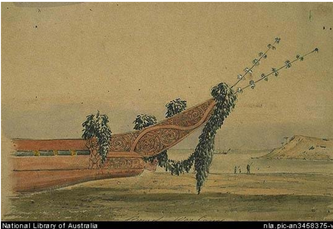
ROBERT MARSH WESTMACOTT Bow of a War Canoe, New Zealand (c.1851) Watercolour and pencil on paper, 175 x 264 mm. (Westmacott's Drawing Book, Nan Kivell Collection, National Library of Australia)

When Rex Nan Kivell purchased Westmacott's Drawing Book it contained sixteen New Zealand works, with all bar one relating to the North Island. The topographic and ethnographic views and figure studies of Maori such as Honi Heke were neither signed nor dated, though all bore some form of inscription, usually in Captain Westmacott's distinctive hand. Sizes were smallish, on average 10 x 8 inches (20 x 25 cm), reflecting their sketchbook origins. On first viewing it would seem all were original works or copies by the good captain, and most were originally catalogued as such.