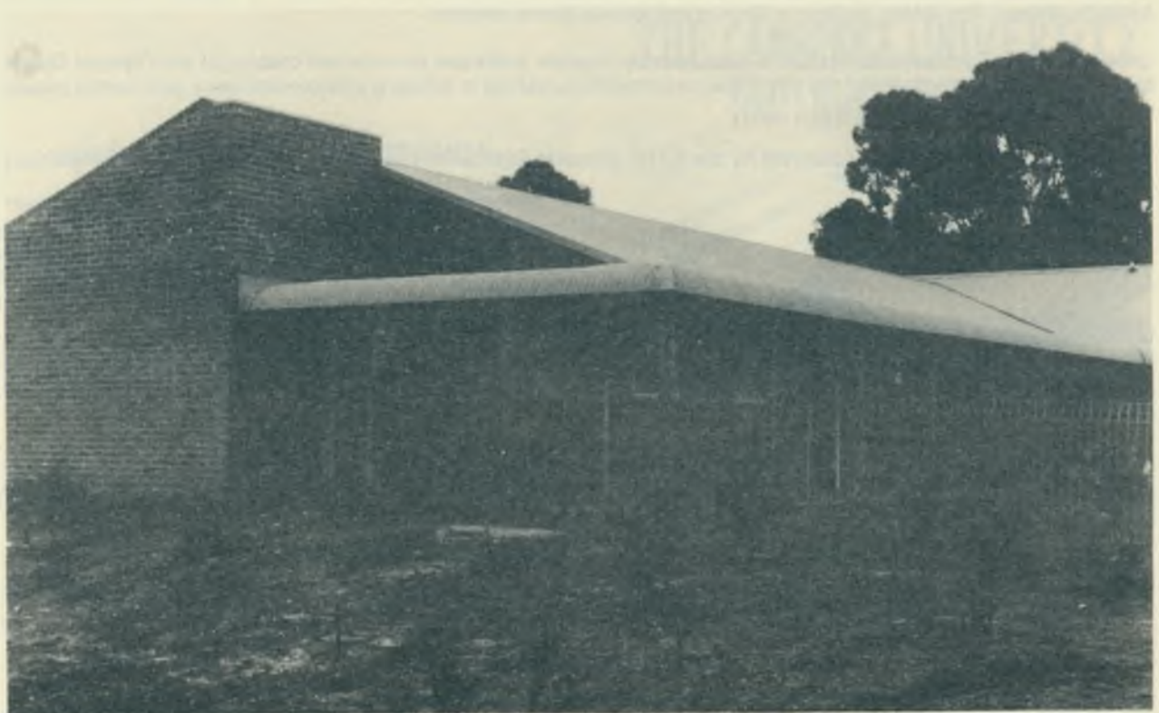
Stage II of the Childcare Centre opened in 1984.