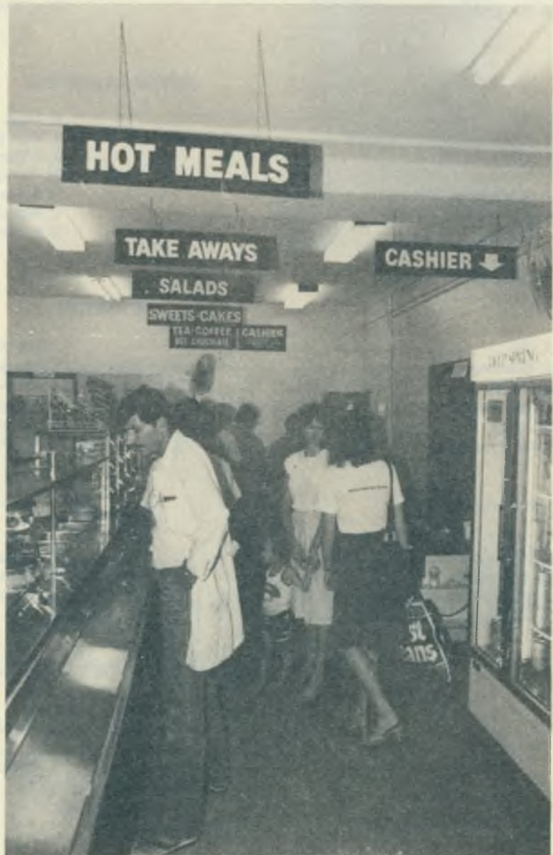
The re-designed Cafeteria-servery

During the year a new Board Room was constructed on the old Northern Lounge balcony, allowing the former Board Room to be converted into much-needed additional office accommodation. The Table-Tennis room was converted into offices for the Sports Association and the Squash Courts foyer and staircase area was upgraded as part of the process of establishing a new operational base for the Sports Association.