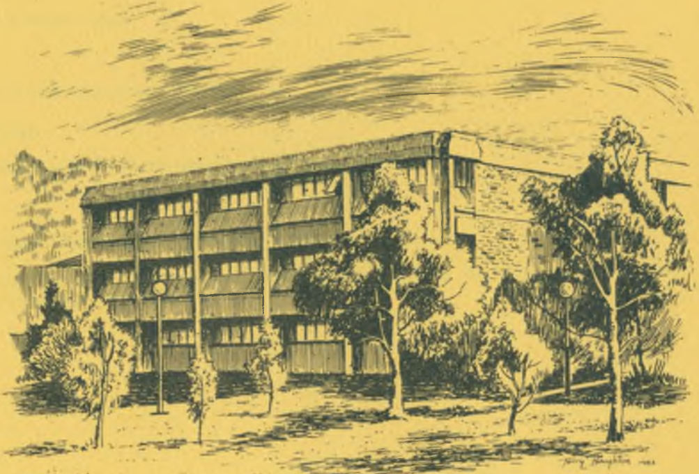
These sketches of University buildings and those appearing elsewhere in this report are available, in a 6 postcard series, from the University Union Shop.

B. Capital Commitment Amounts contracted Sundry Debts Interest in Sundry Debts