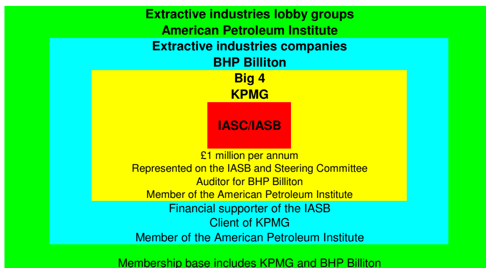
Figure 2. Example of overlaps between the IASC/IASB, KPMG, BHP Billiton, and the American Petroleum Institute