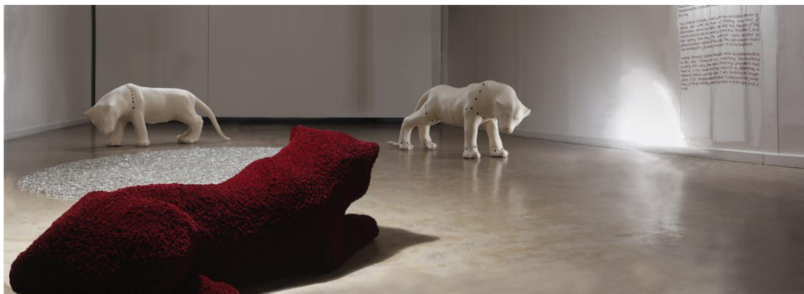
Figure 3: the vanishing. 2010. Fibreglass, cotton, velvet, glass, thread, wax. Variable dimensions. Installation at Faculty of Creative Arts Gallery, University of Wollongong, 2011.

the vanishing considers the concepts of borders, dislocation and postcolonialism. It was a slow build, gathered from local research during a residency in Kolkata, from family stories, chance encounters, and a desire to question entrenched narratives within cultural and personal histories.