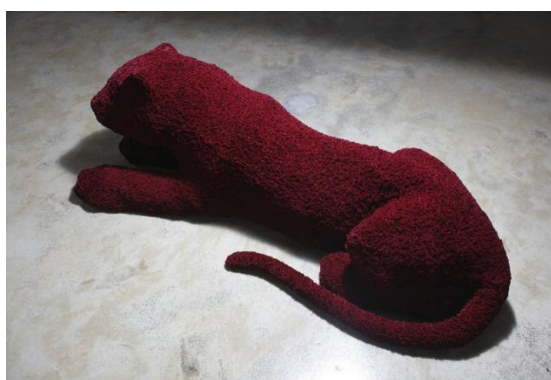
Figures 4 and 5: the vanishing . 2010. Detail. Installation at Faculty of Creative Arts Gallery, University of Wollongong, 2011.