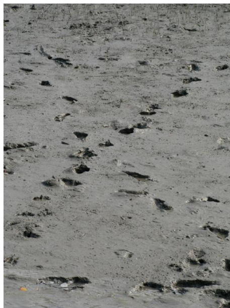
Figure 8: Sundarbans, West Bengal. 2009.

One morning in the Sundarbans we came across some tiger pug marks. Sambhu said they were very fresh, probably from early that morning. They emerged out of the water, across the mud and disappeared into the mangrove forest. This tiger had swum across from one island to the other, most likely in search of food, a distance of about one kilometre. Just a trace. 4