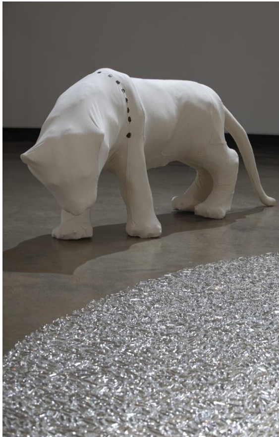
Figure 6: the vanishing . 2010. Detail. Installation at Faculty of Creative Arts Gallery, University of Wollongong, 2011.

The third tiger is encased in hand-stitched blood-red velvet that is both visceral and seductive, and speaks of the abject plight of the animal in the face of its rapidly diminishing numbers.