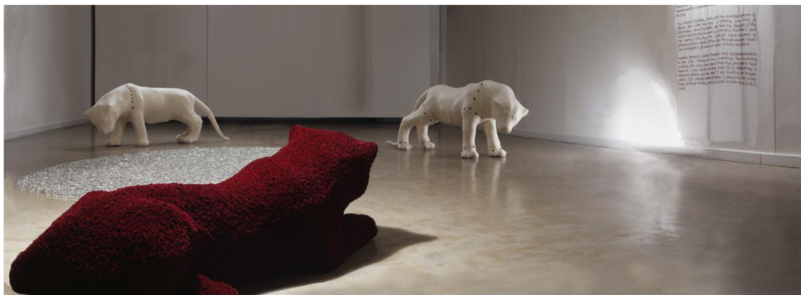
Figure 3: the vanishing. 2010. Fibreglass, cotton, velvet, glass, thread, wax. Variable dimensions. Installation at Faculty of Creative Arts Gallery, University of Wollongong, 2011.

the vanishing considers the concepts of borders, dislocation and postcolonialism. It was a slow build, gathered from local research during a residency in Kolkata, from family stories, chance encounters, and a desire to question entrenched narratives within cultural and personal histories.