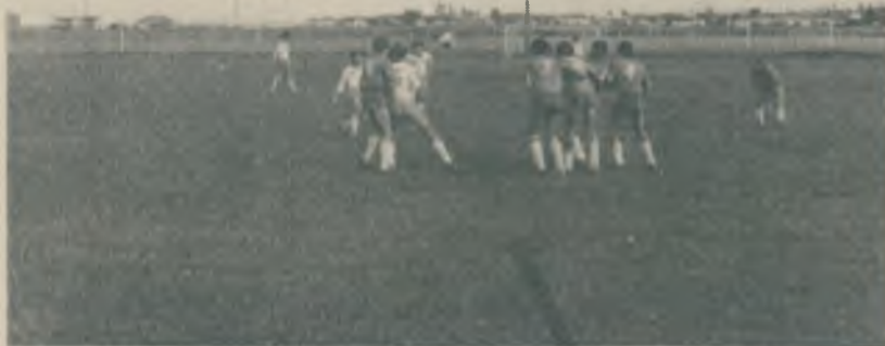
University Soccer Club (white shirts) in action at Woonona

Performances in the District competition were disappointing with all three grades finishing well down in their respective league-tables. However, First Grade achieved some notable successes in knockout tournaments, winning the Bosco K.O. Cup in late 1980, and reaching the final of the I.S.A.'s main trophy event, the Bert Bampton Cup, and losing to Premier Division champions, Shellharbour Workers, only in extra time, after a great display which drew high praise from the senior officials of the I.S.A. The social team continued to compete enthusiastically in the Business Houses League, while the women's team persevered long enough to score at least one goal before the end of the season.