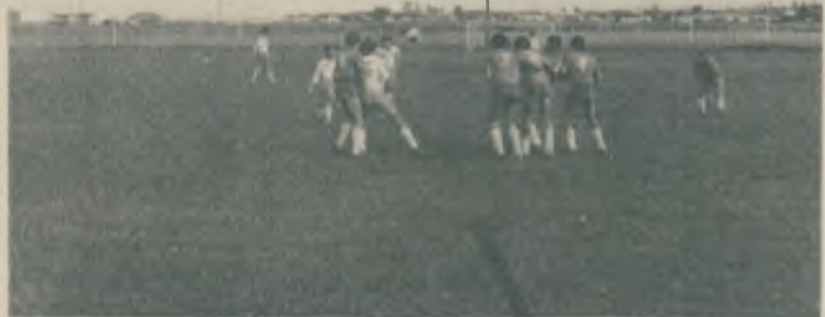
University Soccer Club (white shirts) in action at Woonona

Performances in the District competition were disappointing with all three grades finishing well down in their respective league-tables. However, First Grade achieved some notable successes in knockout tournaments, winning the Bosco K.O. Cup in late 1980, and reaching the final of the I.S.A.'s main trophy event, the Bert Bampton Cup, and losing to Premier Division champions, Shellharbour Workers, only in extra time, after a great display which drew high praise from the senior officials of the I.S.A. The social team continued to compete enthusiastically in the Business Houses League, while the women's team persevered long enough to score at least one goal before the end of the season.