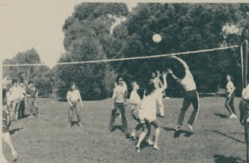
Lunch-time volleyball action

1981 was a good year for the Volleyball Club. At the 1981 Intersivity, hosted by Sydney University, we came fourth (4th) (the best result ever) behind Monash, Melbourne and New South Wales Universities. Six of our University team made the Illawarra team. Also the Volleyball Club was actively involved in the organisation of the local Volleyball Competition. In this competition we came third.